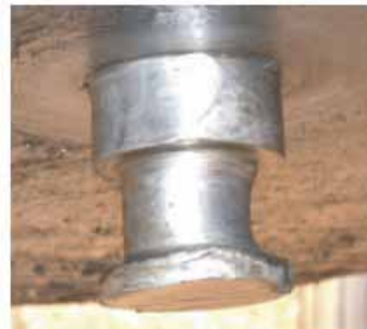
Excessively worn kingpin.

It is extremely dangerous practice to rotate kingpins through 90° when the kingpin is worn down to the minimum wear dimensions and this practice could result in the failure of the kingpin with catastrophic results.