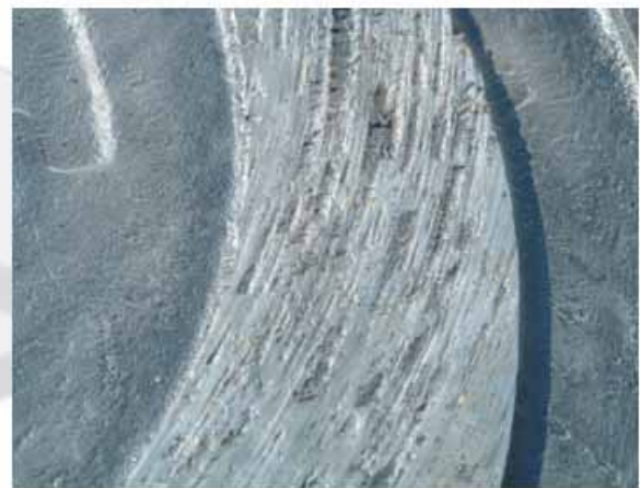
Damage to 5th wheel top plate as a result of incorrect grease.

It is extremely dangerous practice to rotate kingpins through 90° when the kingpin is worn down to the minimum wear dimensions and this practice could result in the failure of the kingpin with catastrophic results.