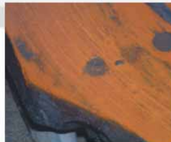
JOST JSK37C fifth wheel worn down to below the allowable level.

The accompanying sketch shows the control dimensions of a 2" kingpin. The dimensions in brackets denote the minimum wear dimension and, once the kingpin is worn down to these minimum dimensions, it should be replaced without delay.